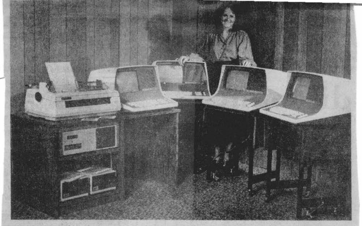
The Micro Mike's Inc. system . . . opening the doors for more businesses to use computers.