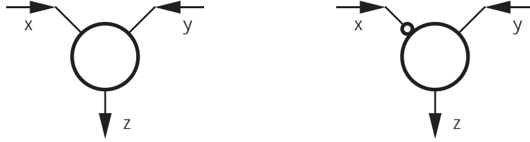
Figure 6-2: Symbolic representation of Muller elements

where x, y are input actions and z is an output action. The initial state of the process is y . z . C_{xyz}^1 corresponding to all the interfaces to the low level.