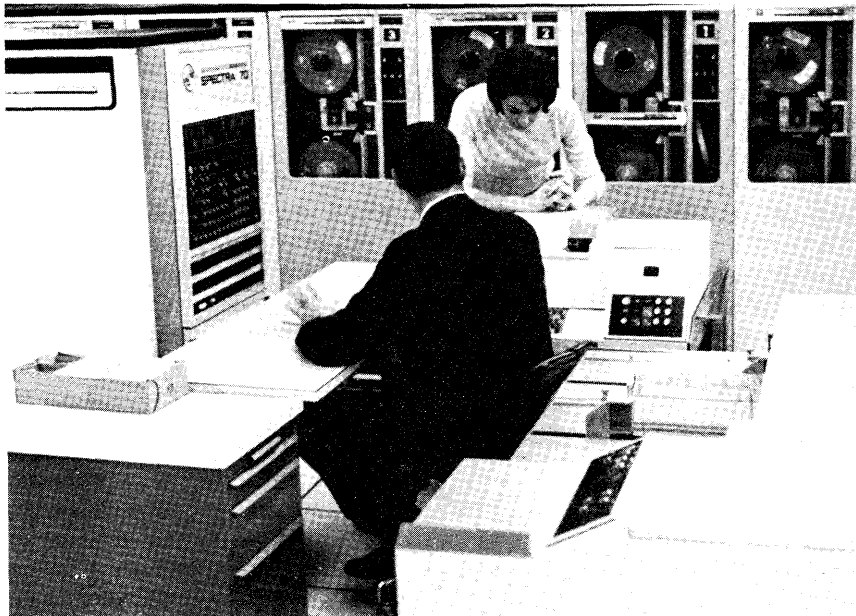
DEBUGGING AT THE console of a prototype Spectra 70/46 Time Sharing System.

The new 70/567 Drum Memory Unit is currently offered for use exclusively with the 70/46 Time Sharing System. In this system, pages of user programs will be stored in on-line disk storage units, from which they will be called to main memory for execution. Once in main memory, program pages that must be temporarily dumped to make room for higher-priority pages are sent to the Drum Memory Unit, where they await rapid retransmission to core when main memory space again becomes available. Also residing in the Drum Memory Unit will be the most frequently used control routines of the 70/46 Time Sharing Operating System (TSOS).