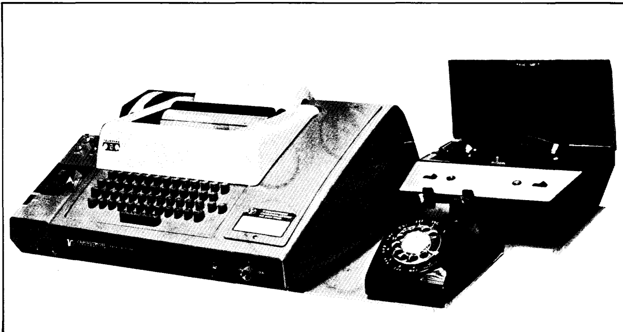
Figure 2. Typical Dialing Unit

Upon receipt of the message LOGON PLEASE:, enter your account, name, and password, in that order, separated by commas. The password and preceding comma are omitted if no password has been assigned.