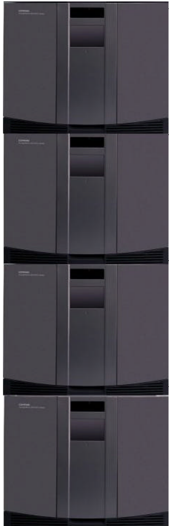
Table Top to Rack Mount Conversion Kits 231894-B21 MSL5000 TT-RK KIT,Alpha Rack 231894-B22 MSL5000 TT-RK KIT,Compaq Rack

255102-B21MSL5052, 0 DR,LVD, RM 249490-B21MSL5052SL ,2 SDLT110/220DR,LVD,TT 249491-B21MSL5052SL ,2 SDLT110/220DR,LVD,RM