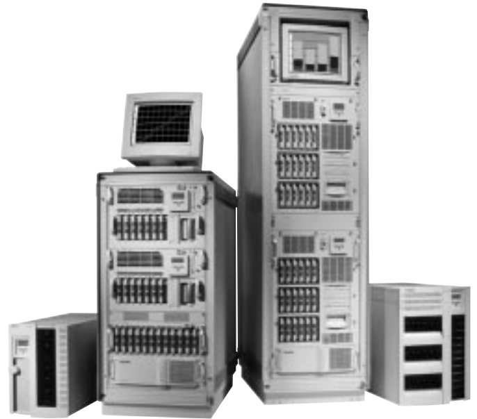
ProLiant 6000/6500/7000 Servers

All claims for both programs must be received at PowerRewards Program Headquarters no later than July 15, 1998. Please refer to Promotion Number SE001 when completing the PowerRewards Sales Claims Form.