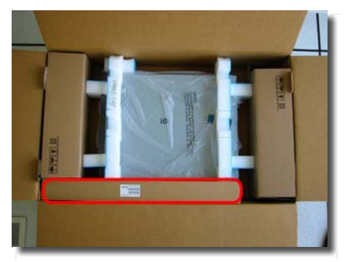
Note: Do not place shipgroup components in the empty space between the system and carton .