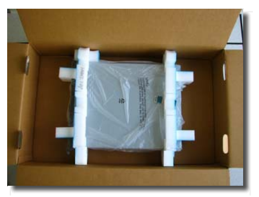
1.8 - Insert fillers 39Y9877 on both sides of unit with cut-out lining up on one side with cushions as shown.