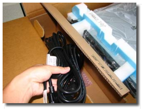
1.10 - Place the rail kit into the recessed area of cushion set as shown.