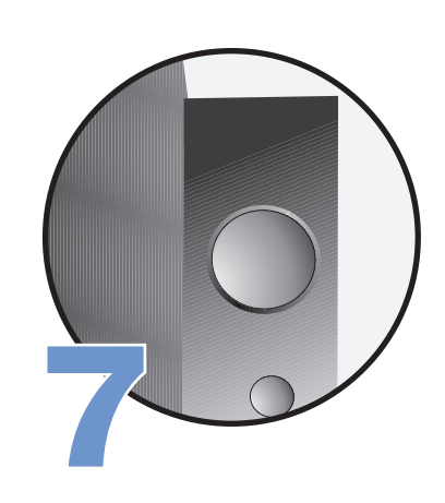
Turn on computer and monitor