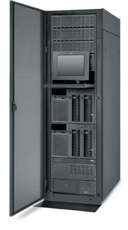
NetBAY42<sup>™</sup> Enterprise Rack

"We found IBM's management suite to be comprehensive, easy to get up to speed on and effortless to administer from. IBM gets an A+ rating for manageability...."